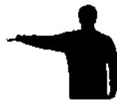
Touch against Left!