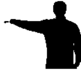
Point in Line!